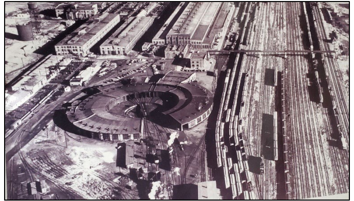
Photo of Rock Island's Silvis turntable and roundhouse in the 40s or 50s (Multiple dates and sources attributed)