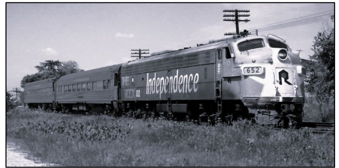
The last regular service to the Quad Cities was run by the Rock Island, which never joined Amtrak. Service ended December 31, 1978.

“With an estimated $30 million annual impact to our region, it will mean tremendous things for our communities.” This money fully funds the almost $900 million project, which will bring the Quad Cities closer to service that will improve regional connectivity, drive economic growth and expand transportation options across the state.