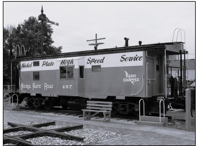
The Linden Depot Museum is asking for donations for a new paint job on their NKP bay-window caboos.