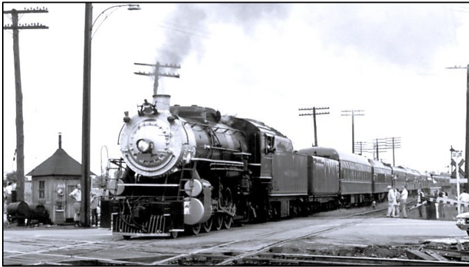
In 1973, Southern 4501 ran multiple excursions around Chicago and the Midwest, like this eastbound move through downtown Hammond, Indiana on Norfolk & Western's former Nickel Plate line.

As Southern 4501's current owner notes, quite perceptively: "For many...the paint isn't just a color — it's a memory. It represents first train rides, family traditions, and the unmistakable presence of steam in motion."